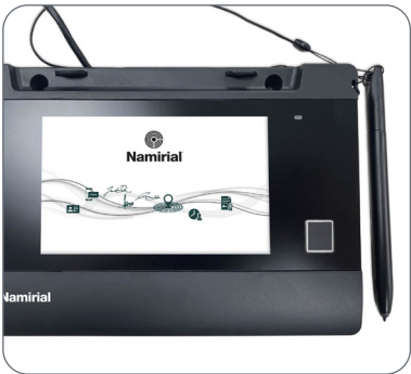
Compact signature display