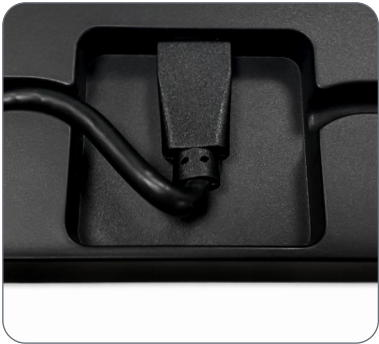
Flexible cable mounting