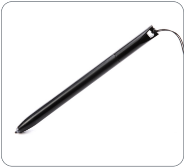
Convenient signature pen